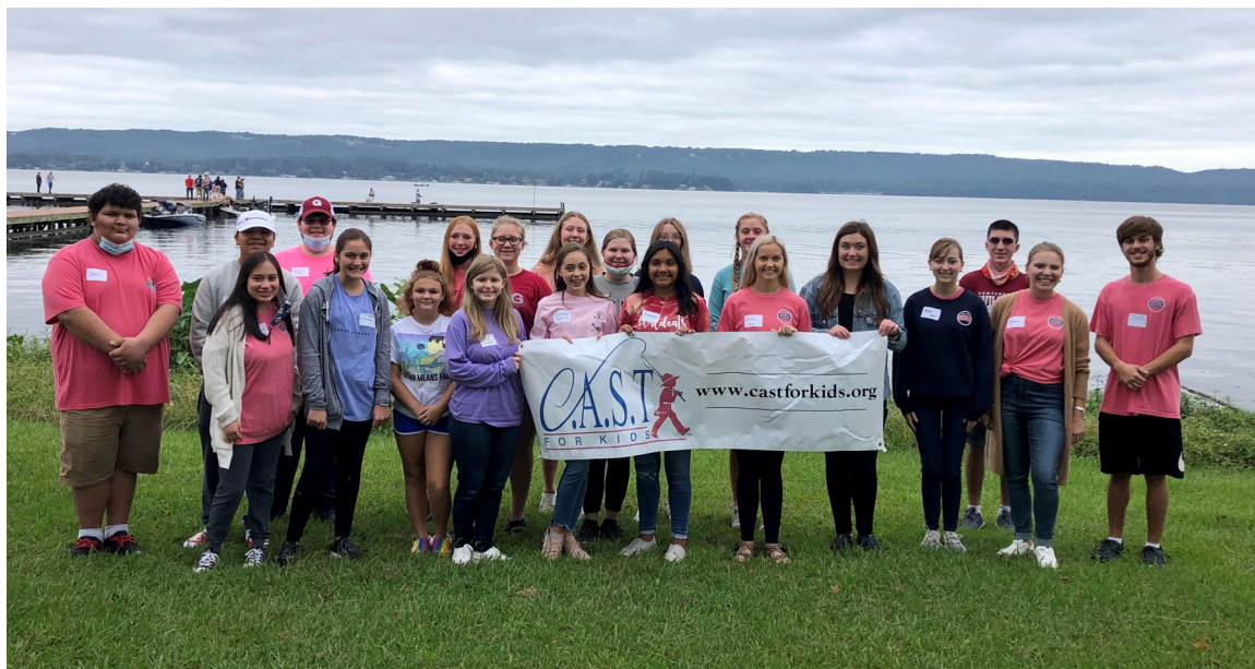
Guntersville High School Anchors and Guntersville Middle School Anchor officers participated in Catch A Special Thrill (CAST) for Kids